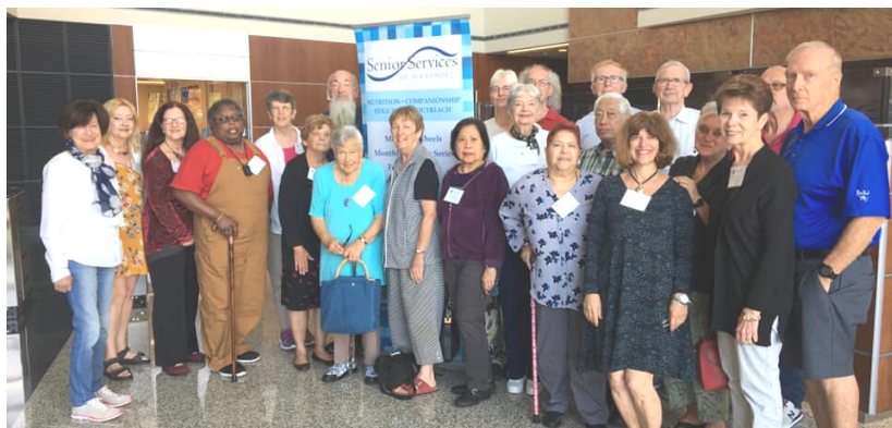
2019 Fall Senior Academy Class

SSA offered the Fall session of the Senior Academy in September. The Spring session was canceled due to the COVID-19 pandemic.