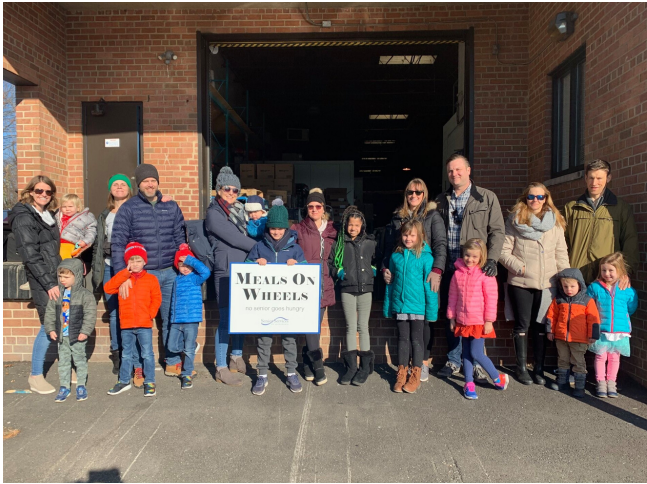
JANUARY: Meals on Wheels Volunteers from Lyles-Crouch Elementary School deliver on Martin Luther King Holiday