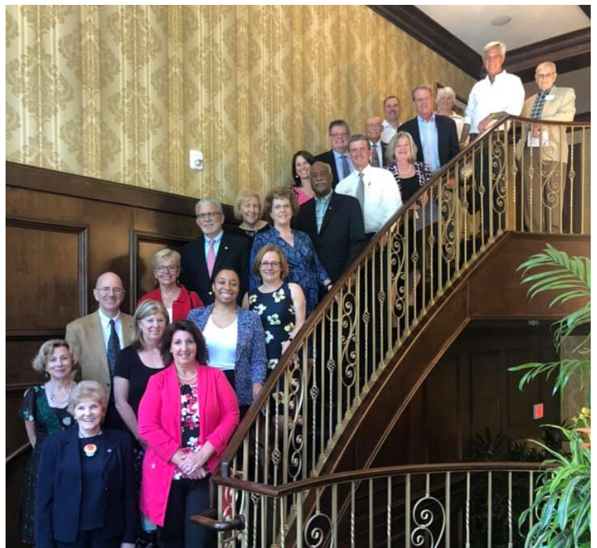
SSA Board Members - Past & Present!