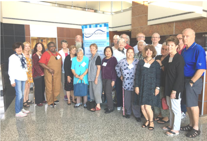
SEPTEMBER: Senior Academy Fall Session