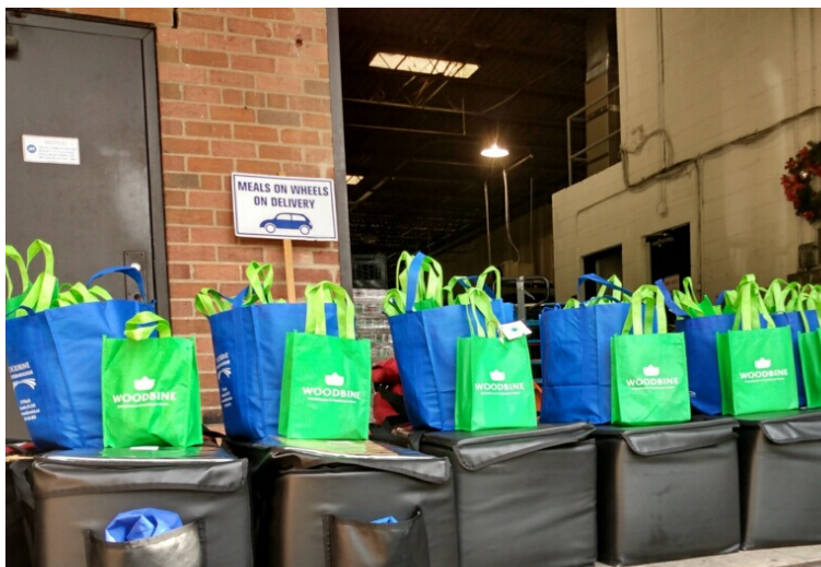
MAY: Woodbine Rehabilitation & Healthcare provided special gift bags to Meals on Wheels clients