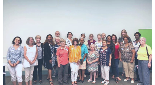
Senior Ambassadors' summer 2019 gathering

Since the COVID-19 pandemic, we have increased our communication with the Senior Ambassadors, passing along important information at least three times a week about how to stay safe during this challenging time.