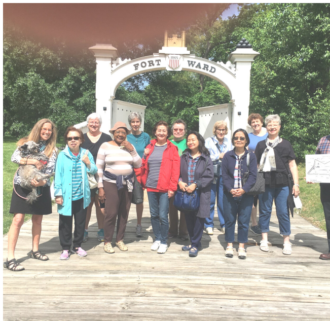
Participants enjoy a beautiful day at Ft. Ward Park, learning about its history.

In partnership with the Alexandria Public Library System, SSA organized monthly historic tours. The Historic Tours include transportation and an educational tour of some of Alexandria's unique museums and historical sites.