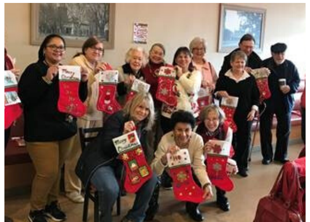
DECEMBER: Coffee Connection Group makes Holiday Stockings for local non-profit