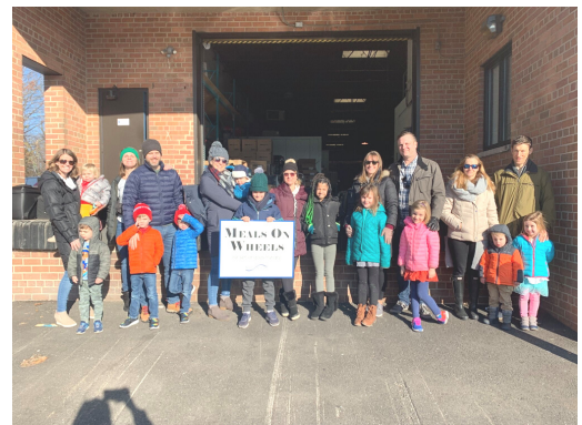
Families from Lyles-Crouch Elementary School Deliver Meals on Martin Luther King, Jr. Holiday

The Meals on Wheels team stepped up to the challenge of providing Meals on Wheels plus a new Frozen Meals program when the pandemic hit Alexandria. Strict health protocols went into place including asking some of SSA's older volunteers to take a break and creating a small corps of younger volunteers, including SSA and City staff. SSA hasn't missed a single day of delivering since the outbreak and is currently delivering 2,500 meals a week.