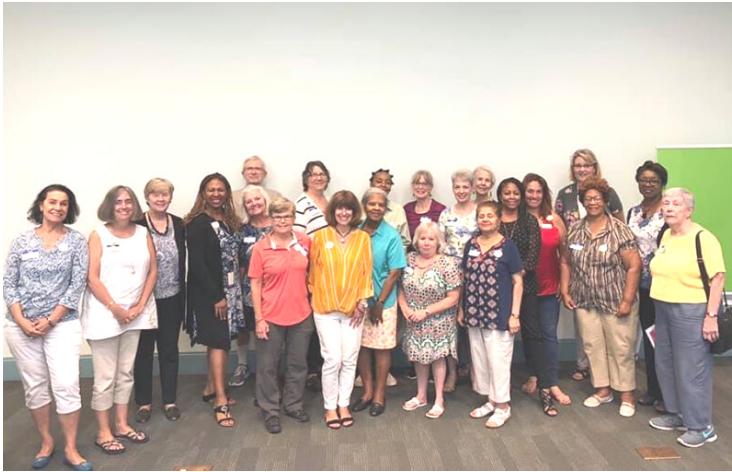
JULY: Summer Gathering of the Senior Ambassadors