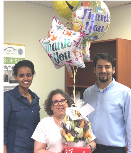
The DOT team was thanked by the City of Alexandria for its commitment to their clients.

SSA has continued to handle reservations during the pandemic to allow clients to keep medical appointments and get essential items such as groceries. It has been a lifesaver for people who rely on this service.