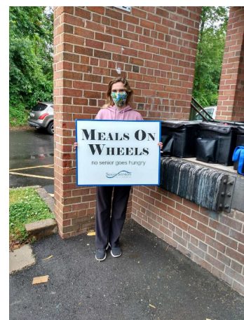
Volunteer prepares to deliver Meals on Wheels