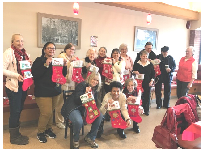
Participants at the December Coffee Connection make holiday stockings for a local non-profit.

This year started off strong with programs featuring a representative from the Prevention of Blindness Society, Giant Food's store nutritionist, and an information session on home care payment options and long-term care insurance.