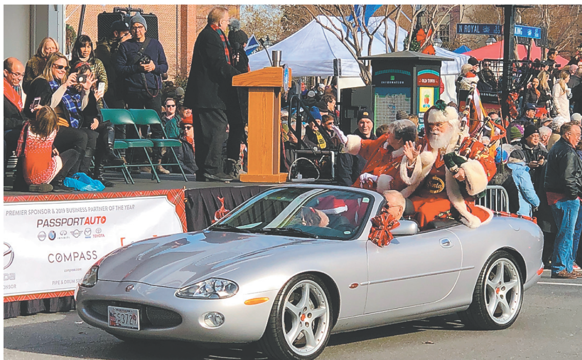
Santa and Mrs. Claus wave to dignitaries on the reviewing stand during the Dec. 7 Scottish Walk Parade.

SEE MORE PHOTOS, PAGE 16