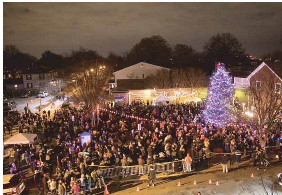
Hundreds gather for the lighting of a community Christmas tree and Menorah Dec. 8 at the Pat Miller Neighborhood Square in Del Ray.